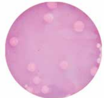
DBRC agar spread plate at 5 days incubation