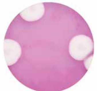
DBRC agar spread plate at 5 days incubation